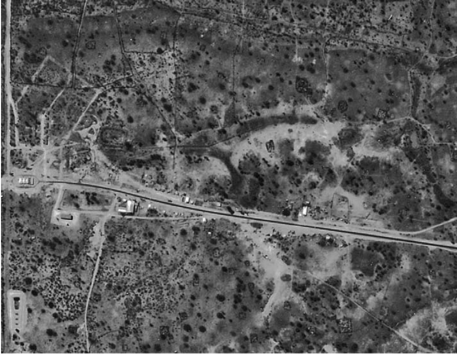
Figure 1. Oshikango in 1996.

developed on the outskirts, away from the main road. A rough estimation based on the aerial views would suggest that the built surface of Oshikango increased fifty-fold over those ten years. The official population of Helao Nafidi Town (comprising Oshikango and the neighbouring four settlements) in 2006 was 43,000, between 5,000 and 8,000 of them living in Oshikango.