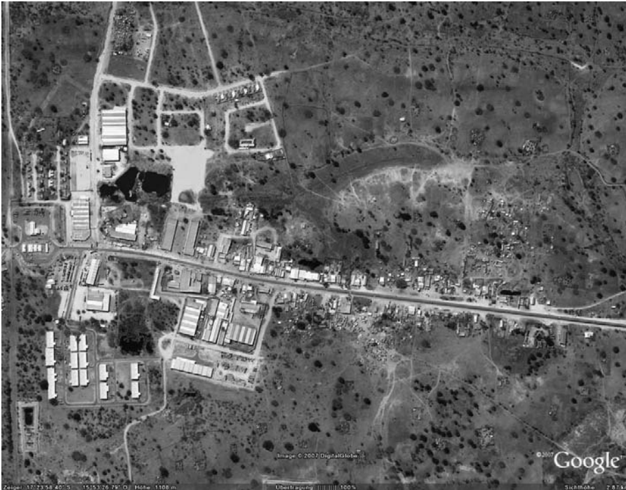
Figure 2. Oshikango in 2006. (Satellite image, Google Earth)

who had laid the foundations for his business empire with shops and supermarkets in colonial Ovamboland (and, since 1977, a beer depot licence for South West African Breweries 2 ), and by a Windhoek-based white trader. Soon after, other large warehouses were opened – by an Angolan Portuguese family who had moved to Namibia in the mid 1970s, a South African working jointly with a Portuguese manager, and a Lebanese family that owned warehouses throughout Southern Africa. 3